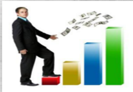
Large Revenue Growth