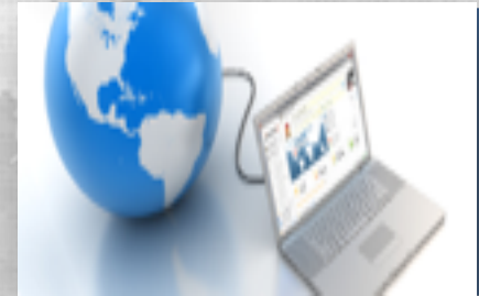
Access from anywhere