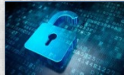
Highest Information Security